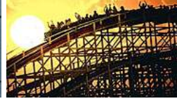
Photos: Regional roller coasters