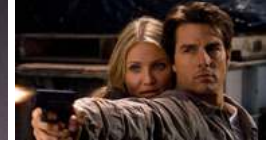
Swift picks: 10 things not to miss this week

EMAIL MARKETING GETS RESULTS! See what it can do for your small business.