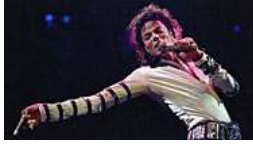
Michael Jackson: Remembering the King of Pop