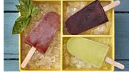
Guide: Summer 2010